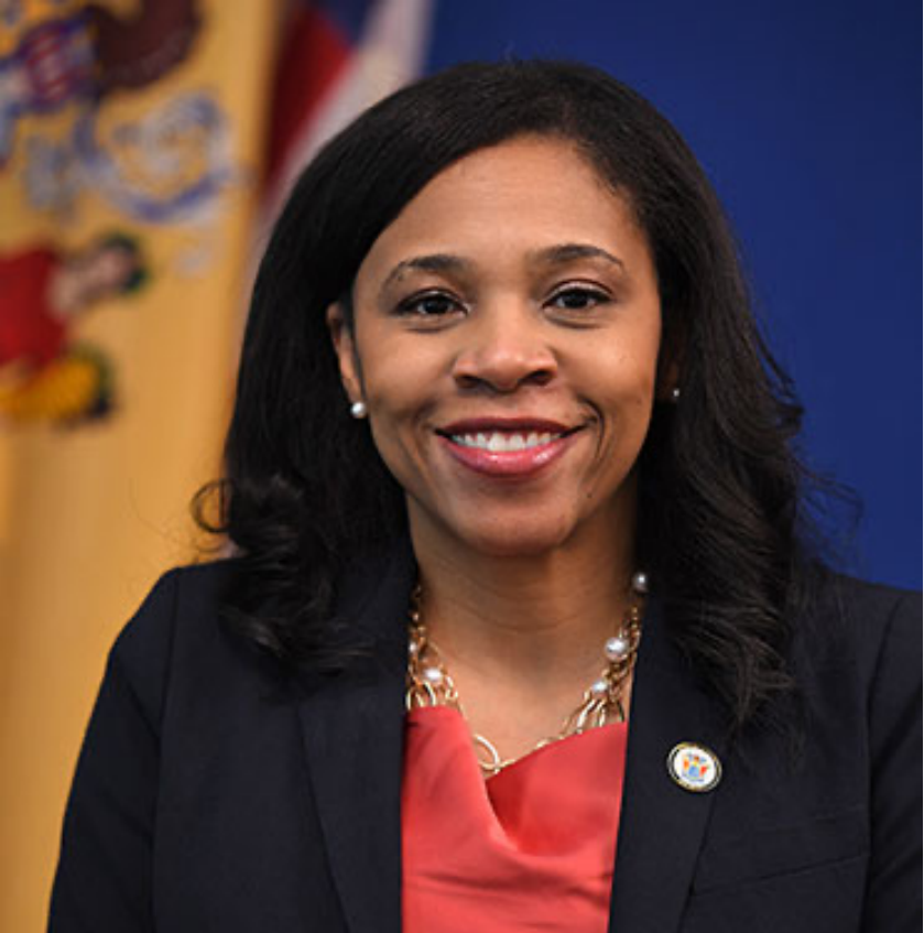
Tahesha Way, Esq. Lt. Governor