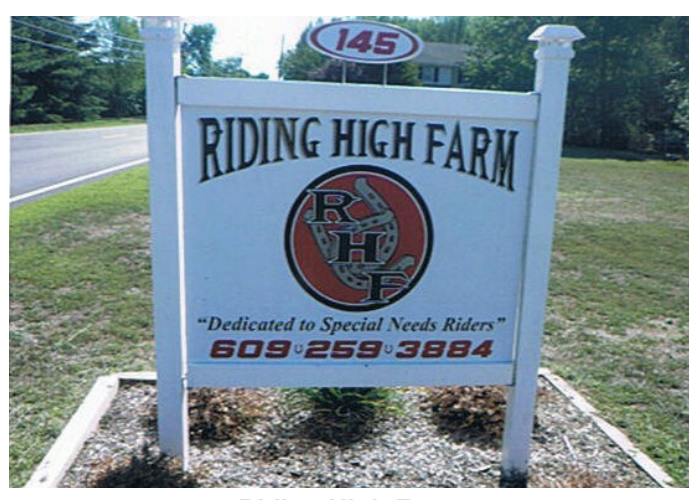
Riding High Farm Located on Route 526 in Allentown.

The Small Business Fund is another way in which the EDA supports small and mid-size businesses in the State. An expedited approval process helps the Small Business Fund program provide below-market rate financing to eligible businesses through direct loans or guarantees, with the choice of a variable or fixed interest rate. Formed in 1910, Galvanic Printing & Plate Co. received a $250,000 loan through the Fund to purchase a new press and expand its business capabilities. The Moonachie-based commercial printing company expects to maintain its staff of nearly 60 and create four new jobs. Riding High Farm of Allentown closed a $290,000 Small Business Fund Ioan to support the not-for-profit organization's new Riding High Day Program, which serves the disabled community with training in equine care and farm management. Riding High expects to add three new positions to its staff of 11.