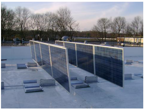
Hausmann Industries New Solar Electric System The company offers live renewable energy monitoring at www.hausmann.com/green/liveupdates.html.

Nautilus Solar received a total of $5 million to build the largest solar energy facility at a university in the United States. The 3.5 MW solar energy project will comprise of rooftop and parking lot solar installations on the campus of William Paterson University in Wayne. The system is estimated to save the University $4.3 million in energy costs over the next 15 years and will provide 15 to 20 percent of the University's energy needs. This project is leveraging over $15.5 million in total public/ private investment and is expected to lead to the creation of an estimated 10 new jobs. The EDA also finalized assistance to Hausmann Industries, Inc., a Northvalebased manufacturer of equipment primarily used in the healthcare industry. The $670,000 loan helped the company purchase a 210kW solar electric system that is estimated to reduce greenhouse gas emissions by 3,212 metric tons over its 25-year life. Hausmann was the first in its industry to introduce a green line of "eco-friendly" treatment tables, carts and medial cabinetry for safer air quality and healthier patients. The company expects to add five new positions to its staff of 81 as it continues to expand in New Jersey.