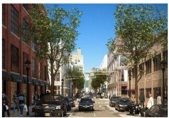
Rendering of Halsey Street Teacher Village The Teacher Village is located on both sides of Halsey Street, connecting the existing University Heights area with the Prudential Center and the rest of downtown Newark's existing core.

Since inception, 10 projects have been approved for a total of up to $394 million under the Urban Transit Hub Tax Credit program. These projects, which span Elizabeth, Jersey City, Newark and New Brunswick, are expected to leverage more than $962 million in private investment and lead to the creation of more than 1,400 new, permanent jobs and over 3,815 construction jobs. RBH-TRB Newark Holdings was approved for up to $17.38 million under the program to support $ Halsey Street Teacher Village project, which involves an estimated $ 124.2 million in capital investment. The 368,993-square-foot development planned for downtown Newark will include workforce housing, three charter schools and a mix of retail amenities. Teacher Village is the first development phase in the SoMa Newark redevelopment plan, which consists of 12 square blocks and 15 million square feet of development in the city's downtown. When completed, Teacher Village is expected to create 450 construction jobs and 466 fulland part-time jobs. The project was also approved for up to $20.5 million in tax reimbursements for up to 20 years under the ERG program.